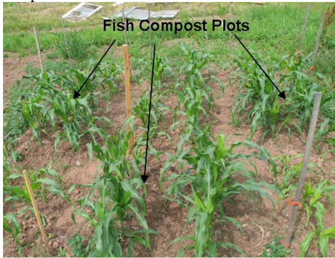
Table 8. Mean and standard deviation of corn plant height to the last full leaf on each plant in each treatment (leaf collar method). Measurements occurred on 8/3/2007.

Figure 2. Photograph of corn test plot on 7/15/07. Corn plants grown in soil amended with fish compost are shown.