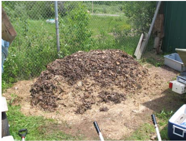
Figure 1. Fish compost pile, completed on 6/15/06.

Three noteworthy points deserve mention for developing future compost piles. First, the pile should be created as quickly as possible in order to minimize odors and fly attraction. Second, at least a 12-inch cover layer of leaves, straw, grass clippings, other compost or soil is recommended for the top of the pile after the fish waste and sawdust/wood chips are mixed together to further keep down odors. Third, volume may be a more practical and consistent way to estimate the amount of materials needed for the compost pile for a “back-yard” compost operation as it is easier to estimate visually than weight, which can also be highly variable due to changes in percent moisture.